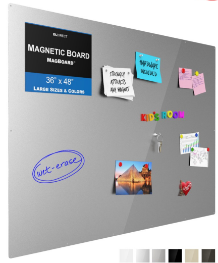
MagPanel™ P/N: HMB*

Any questions or problems, please contact us: